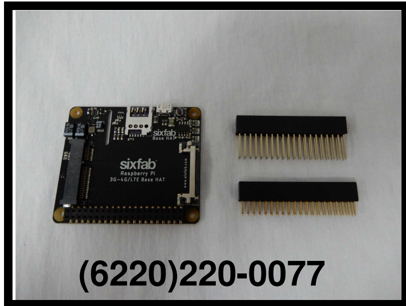
Photo of the Submitted Sample